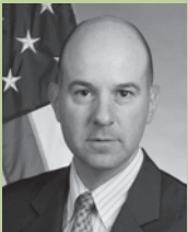
DAVID J. KAPPOS UNDER SECRETARY OF COMMERCE FOR INTELLECTUAL PROPERTY DIRECTOR OF THE U.S. PATENT AND TRADEMARK OFFICE

She holds an LLM from the London School of Economics, a J.D. from Georgetown University Law School, and a B.S. in Foreign Service from Georgetown University's School of Foreign Service.